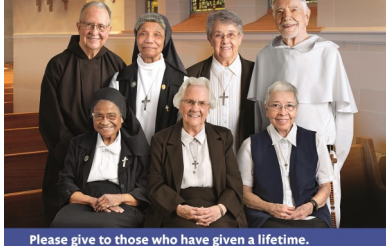
Please give to those who have given a lifetime.

You are being asked once again to come to the aid of retired Religious who are in need of your financial assistance by generously responding to the RETIREMENT FUND FOR RELIGIOUS collection schedule for the weekend of December 10th and 11th.