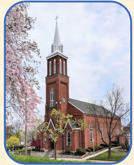
St. Michael The Archangel Parish 301 Spruce St. Hollidaysburg, PA 16648