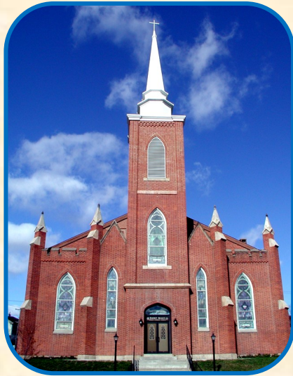
St. Mary 312 Clark St. Hollidaysburg, PA 16648