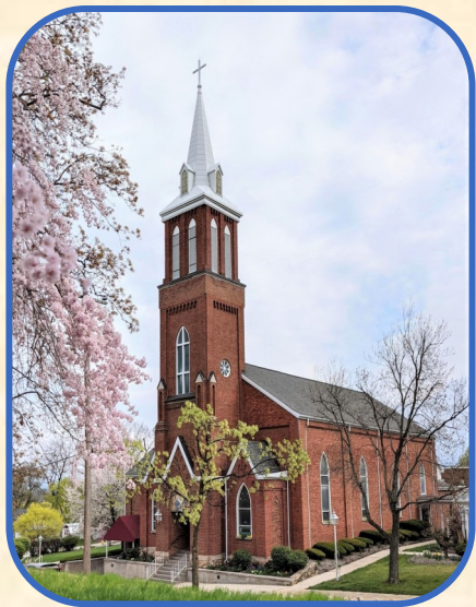
St. Michael The Archangel Parish 301 Spruce St. Hollidaysburg, PA 16648

St. Mary - Mass Schedule Saturday Vigil: 4:00 PM Sunday: 8:00 and 10:00 AM. Daily and Holy Days: See schedule inside