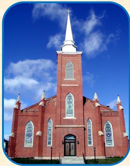
St. Mary 312 Clark St. Hollidaysburg, PA 16648