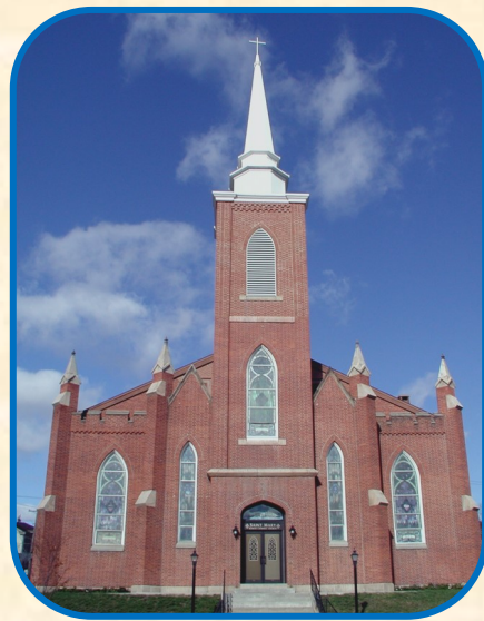
St. Mary 312 Clark St. Hollidaysburg, PA 16648