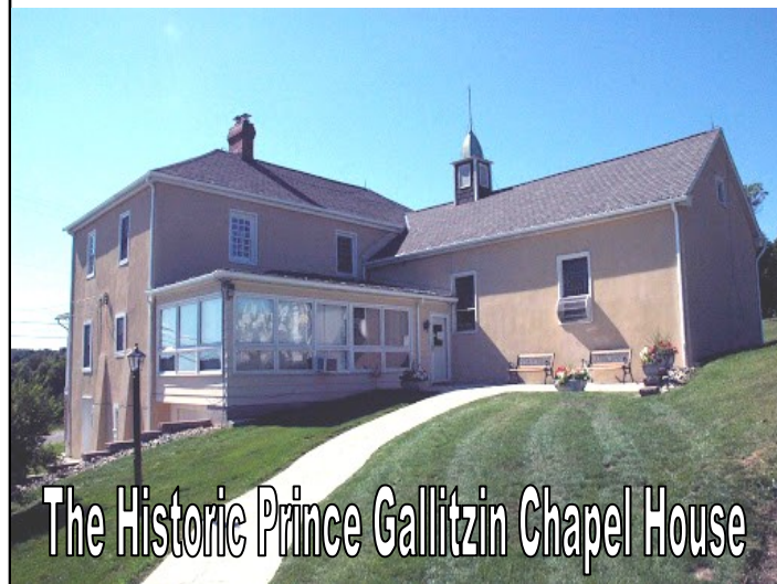
The Historic Prince Gallitzin Chapel House

The historic Prince Gallitzin Chapel House, next to the Our Lady of the Alleghenies Shrine, will be open on the following Sunday afternoons from 3:00-6:00 PM for self-guided tours and visits: This Sunday, June 6 and 20; July 18; and August 1, 15, and 29.