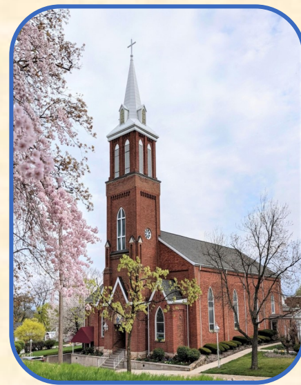
St. Michael The Archangel Parish 301 Spruce St. Hollidaysburg, PA 16648

St. Mary - Mass Schedule Saturday Vigil: 4:00 PM Sunday: 8:00 and 10:00 AM. Daily and Holy Days: See schedule inside