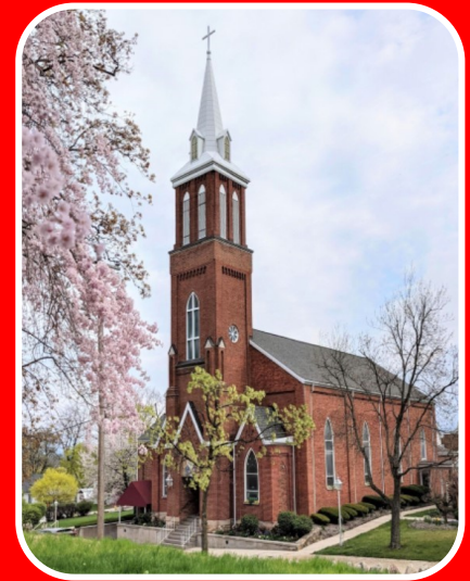
St. Michael The Archangel Parish 301 Spruce St. Hollidaysburg, PA 16648

Solemnity of Pentecost Sunday Cycle B May 19, 2024