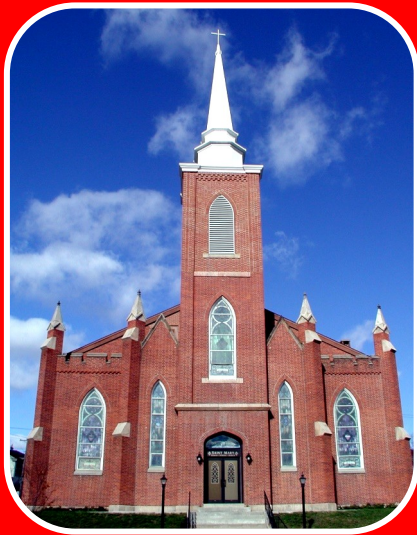
St. Mary 312 Clark St. Hollidaysburg, PA 16648