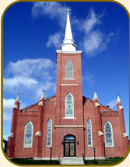
St. Mary 312 Clark St. Hollidaysburg, PA 16648 814-695-0622