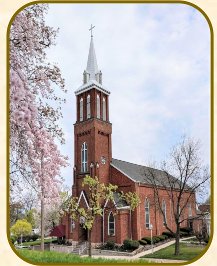
St. Michael the Archangel Parish 301 Spruce St. Hollidaysburg, PA 16648 814-695-0912