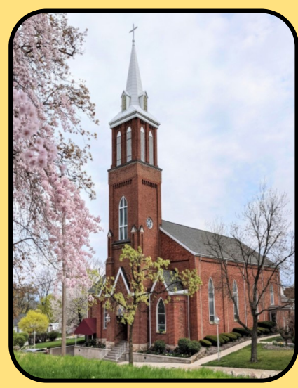
St. Michael The Archangel Parish 301 Spruce St. Hollidaysburg, PA 16648

Websit<mark>e:.bishopguilfoyleacad</mark>er<mark>ny.org</mark>