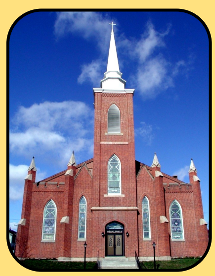
St. Mary 312 Clark St. Hollidaysburg, PA 16648