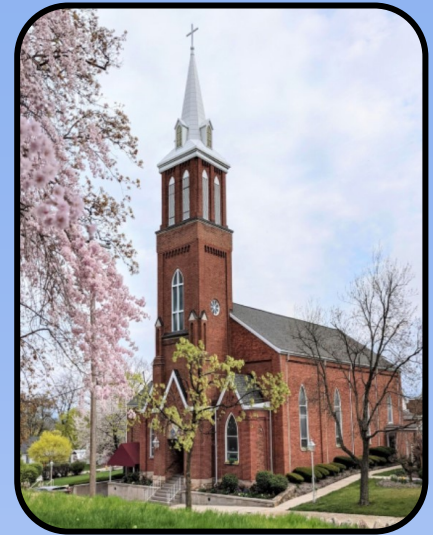
St. Michael The Archangel Parish 301 Spruce St. Hollidaysburg, PA 16648

Sixth Sunday of Easter Cycle B May 5, 2024