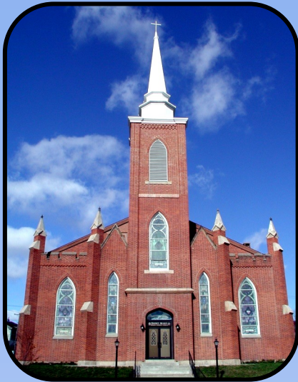
St. Mary 312 Clark St. Hollidaysburg, PA 16648