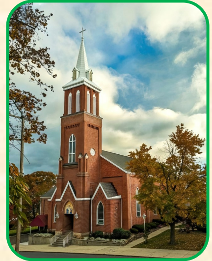
St. Michael the Archangel Parish 301 Spruce St. Hollidaysburg, PA 16648 814-695-0912