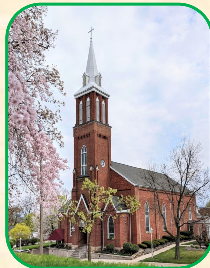
St. Michael the Archangel Parish 301 Spruce St. Hollidaysburg, PA 16648 814-695-0912

29th Sunday in Ordinary Time October 16, 2022