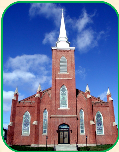
St. Mary 312 Clark St. Hollidaysburg, PA 16648 814-695-0622

Mass Schedule at St. Mary: Saturday Vigil: 4:00 PM Sunday: 7:30 and 10:00 AM. Daily and Holy Days: See inside