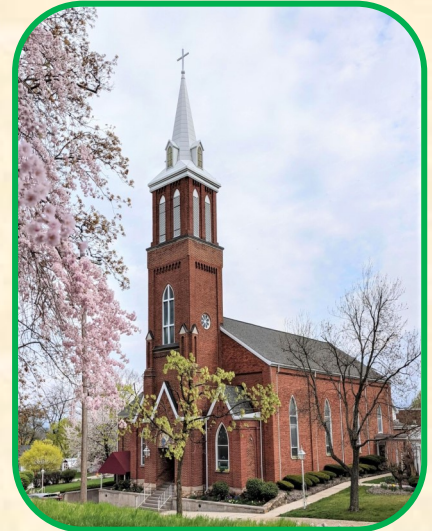
St. Michael the Archangel Parish 301 Spruce St. Hollidaysburg, PA 16648 814-695-0912

27th Sunday in Ordinary Time October 2, 2022