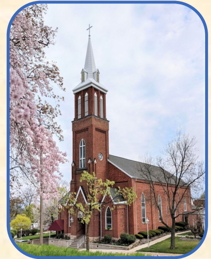
St. Michael The Archangel Parish 301 Spruce St. Hollidaysburg, PA 16648