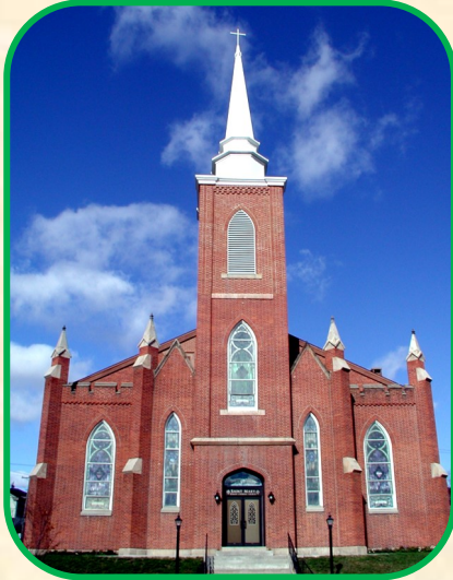
St. Mary 312 Clark St. Hollidaysburg, PA 16648 814-695-0622