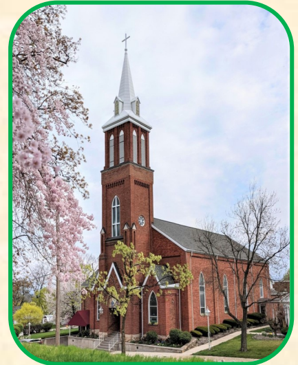
St. Michael the Archangel Parish 301 Spruce St. Hollidaysburg, PA 16648 814-695-0912