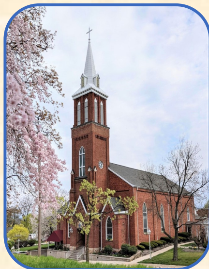
St. Michael The Archangel Parish 301 Spruce St. Hollidaysburg, PA 16648