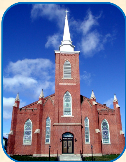
St. Mary 312 Clark St. Hollidaysburg, PA 16648