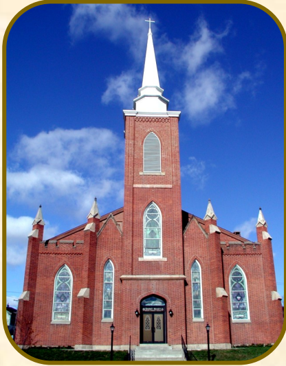
St. Mary 312 Clark St. Hollidaysburg, PA 16648 814-695-0622