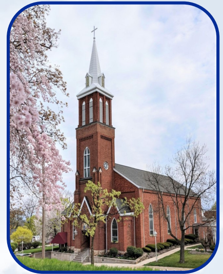
St. Michael the Archangel Parish 301 Spruce St. Hollidaysburg, PA 16648 814-695-0912

13th Sunday in Ordinary Time June 26, 2022