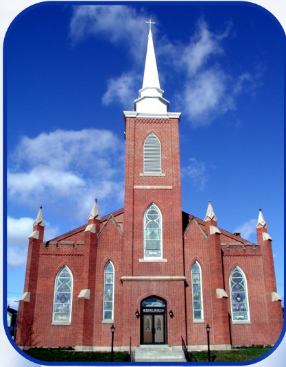
St. Mary 312 Clark St. Hollidaysburg, PA 16648 814-695-0622