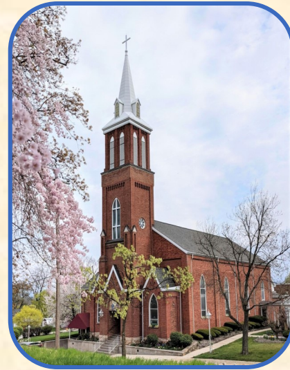
St. Michael The Archangel Parish 301 Spruce St. Hollidaysburg, PA 16648