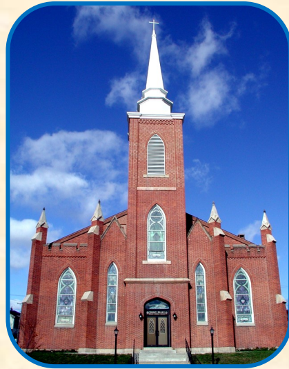
St. Mary 312 Clark St. Hollidaysburg, PA 16648