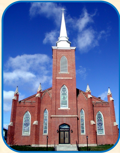
St. Mary 312 Clark St. Hollidaysburg, PA 16648