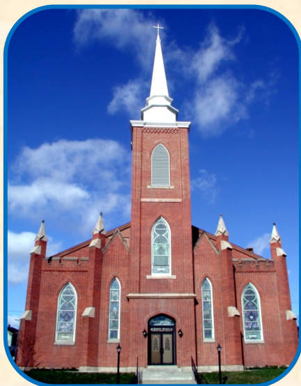
St. Mary 312 Clark St. Hollidaysburg, PA 16648