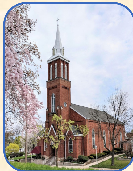
St. Michael The Archangel Parish 301 Spruce St. Hollidaysburg, PA 16648

St. Mary - Mass Schedule Saturday Vigil: 4:00 PM Sunday: 8:00 and 10:00 AM. Daily and Holy Days: See schedule inside