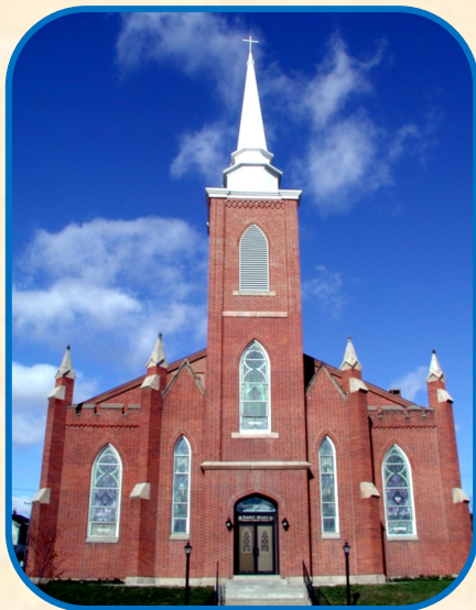
St. Mary 312 Clark St. Hollidaysburg, PA 16648