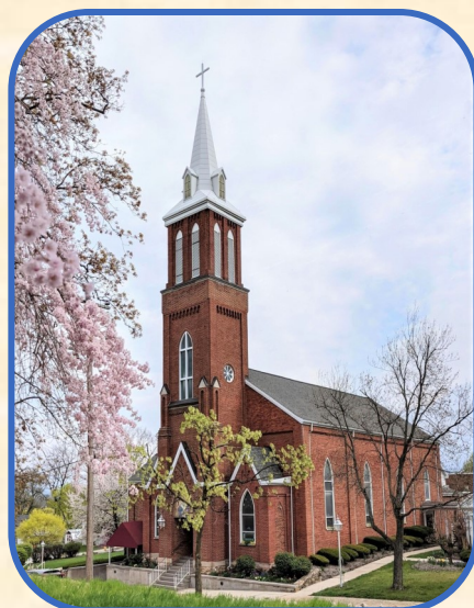
St. Michael The Archangel Parish 301 Spruce St. Hollidaysburg, PA 16648