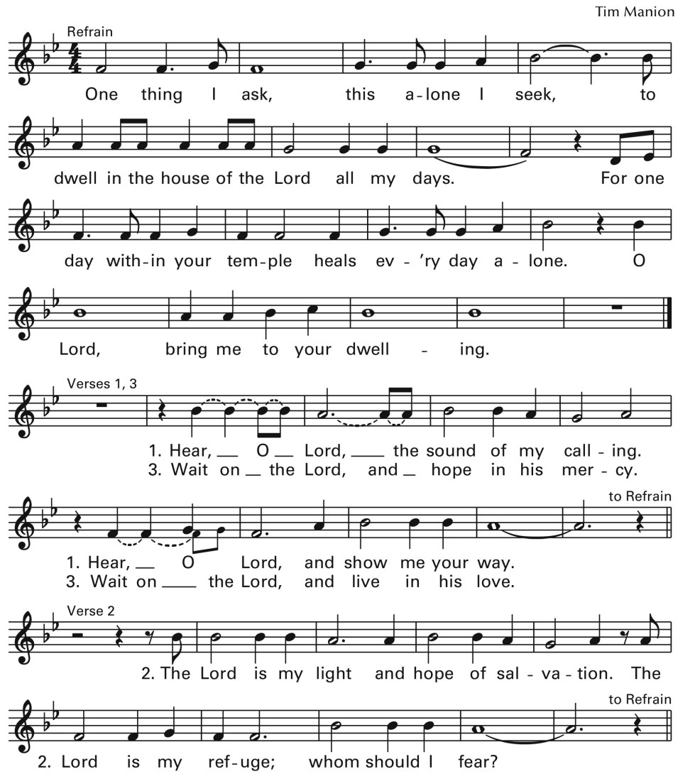
Text: Based on Psalm 27. Text and music © 1981, OCP. All rights reserved.