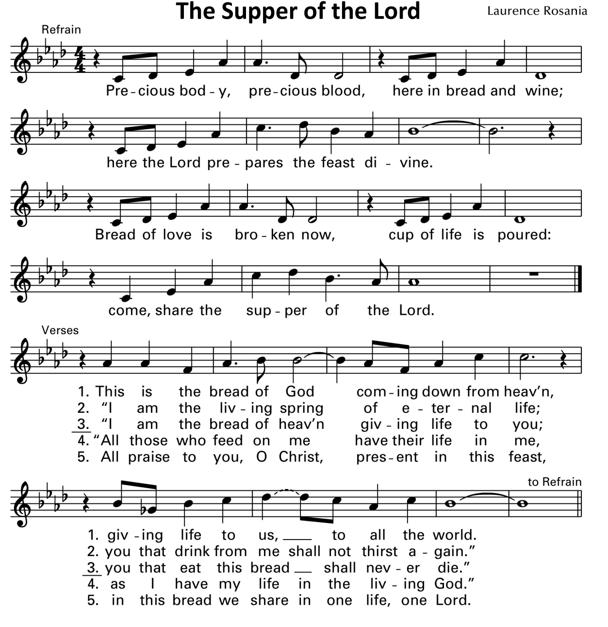
Vss. 1-4: Based on John 4, 6. Text and music © 1994, Laurence Rosania. Published by OCP Publications. All rights reserved.