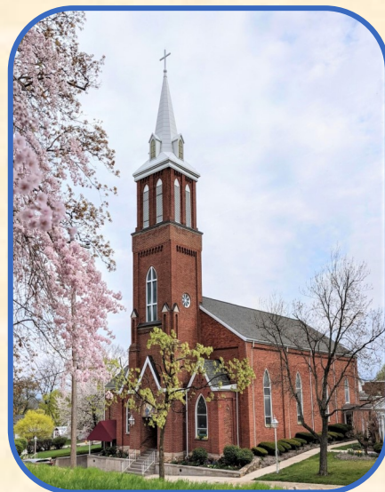
St. Michael The Archangel Parish 301 Spruce St. Hollidaysburg, PA 16648

St. Michael - Mass Schedule Saturday Vigil: 5:00 PM Sunday: 8:30, 10:00 and 11:30 AM. Daily and Holy Days: See schedule inside