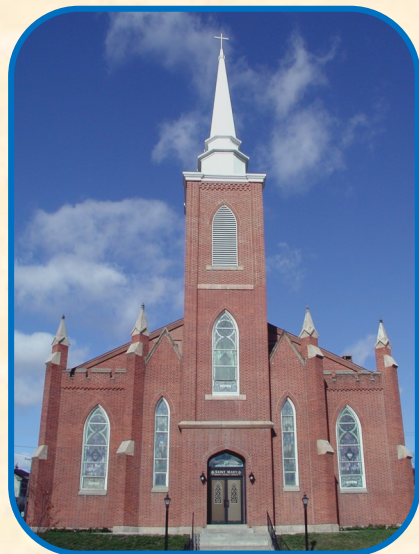
St. Mary 312 Clark St. Hollidaysburg, PA 16648

St. Mary - Mass Schedule Saturday Vigil: 4:00 PM Sunday: 8:00 and 10:00 AM. Daily and Holy Days: See schedule inside