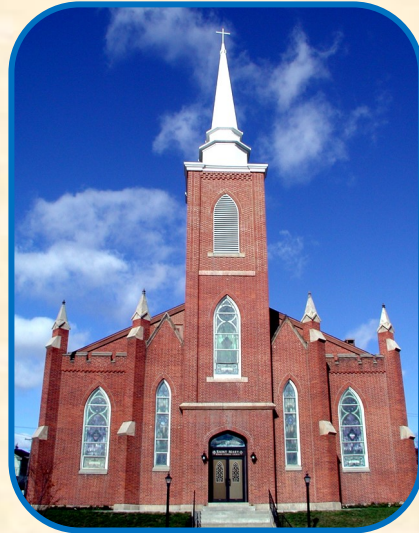
St. Mary 312 Clark St. Hollidaysburg, PA 16648