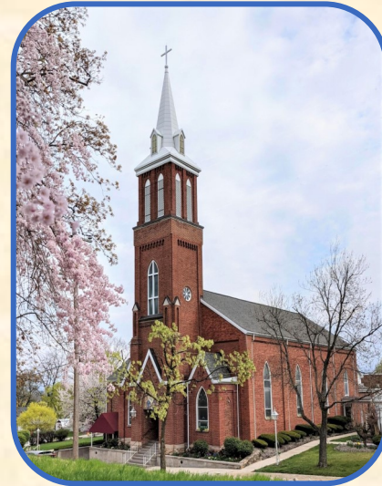
St. Michael The Archangel Parish 301 Spruce St. Hollidaysburg, PA 16648

33rd Sunday in Ordinary Time November 14, 2021