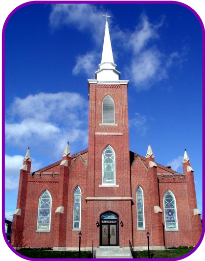
St. Mary 312 Clark St. Hollidaysburg, PA 16648

Mass Schedule at St. Mary: Saturday Vigil: 4:00 PM Sunday: 7:30 and 10:00 AM. Daily and Holy Days: See inside