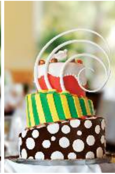
TROPICAL ELEGANCE $11 (51-100 guests)