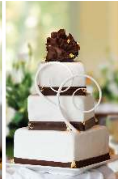
SIMPLE AND SWEET $11 (101-150 guests)

There are no substitutions unless there is an allergy or special dietary reason.