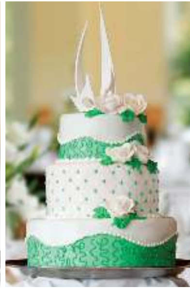
BRIDAL BLISS $10 (51-100 guests)