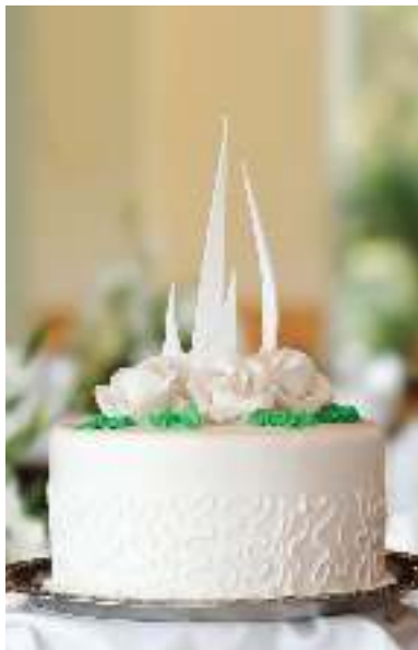
SHIMMERING ROYALTY $8 (up to 25 guests)

Vanilla, Chocolate, Mocha, Coffee, Caramel, Pistachio, Strawberry, Raspberry, Blueberry, Orange, Lemon, Pineapple