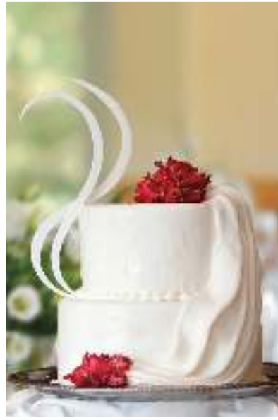
ENCHANTING PEARL $9 (26-50 guests)