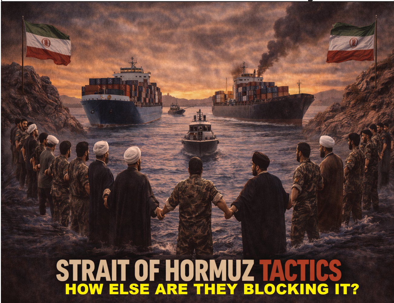
STRAIT OF HORMUZ TACTICS HOW ELSE ARE THEY BLOCKING IT?