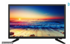
Kogan 24" LED TV & DVD Combo (Series 6 EH6100) for... Kogan