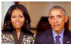
[Photos] Obama's New Home Makes The White House Look Like A Shack Hooch