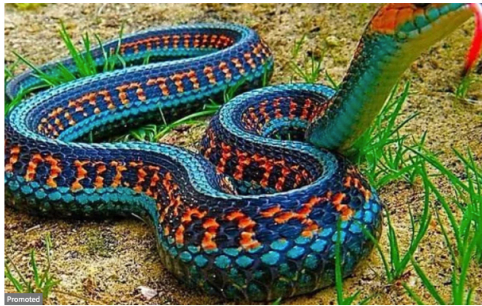
[Pics] The Deadliest Snake on Earth Comes From Queensland Ice Pop