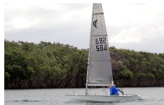
Port Macquarie Sailing Club