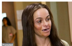
What These Iconic Ugly Characters Look Like In Real Life Trend Chaser