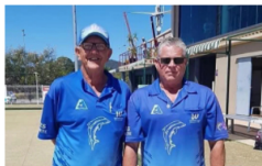
Westport Men's Bowling Club