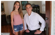
[Pics] School expels teen over outfit, regrets it when they see who dad is React Share