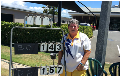
Westport Women's Bowling Club