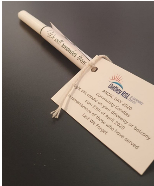
The Oatley RSL is handing out free candles for Anzac Day services.

The Oatley RSL in southern Sydney has been handing out candles for those in the community to light during their at-home dawn service.