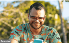
Get bonus data on selected Pre-Paid plans. See how. Telstra