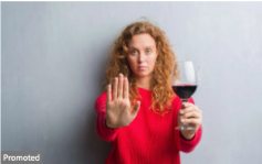
Are You A Sheep Or A Trendsetter? Naked Wines