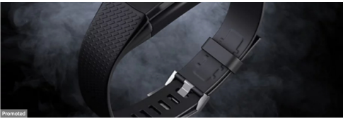
All Seniors Should Wear This $49 Health Bracelet consumertechweb.com