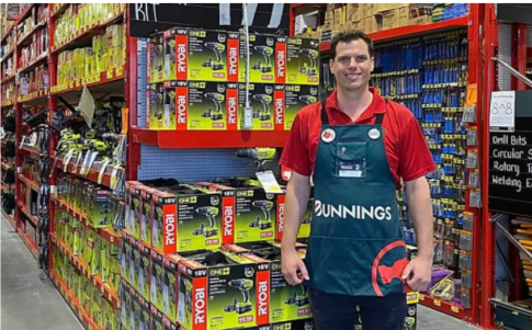
Bunnings is here Young Witness