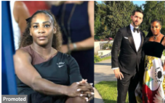
[Pics] Weird Things Everyone Ignores About Serena Williams' Marriage Hooch