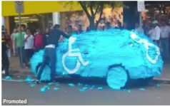
40 People Who Messed With The Wrong Person Trend Chaser