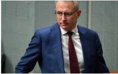
ABC to justify 'Canberra bubble' program