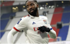
Lille miss chance to draw level with PSG