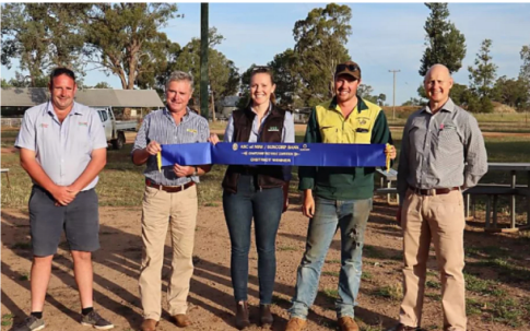
Bribbaree Show Society top crops for 2020 named Young Witness