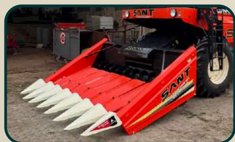
Fits Any Brand Harvester