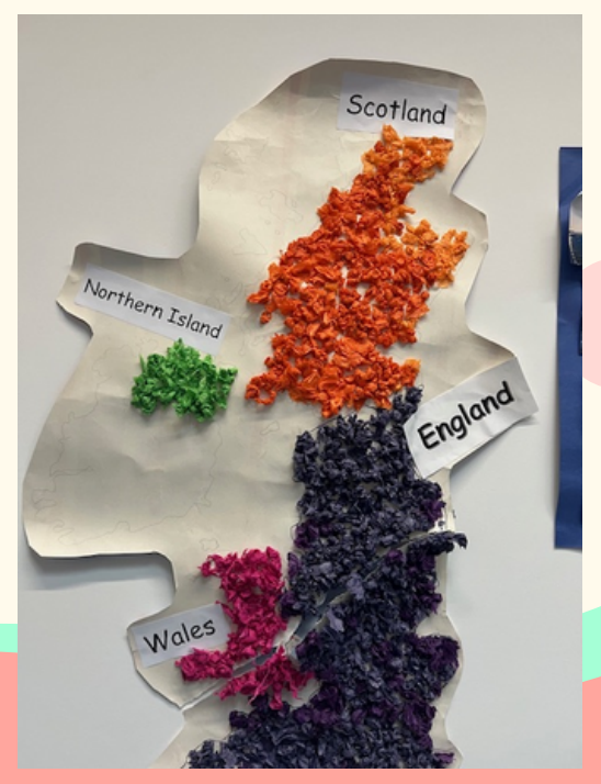
UK Artwork by Beech Class

We would like to thank everyone who has been involved for their support and Kindness.