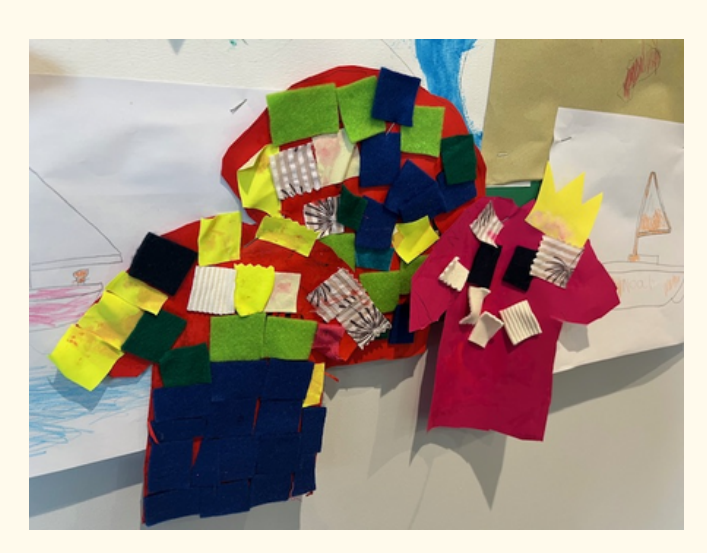
Shirt artwork by Oak Class