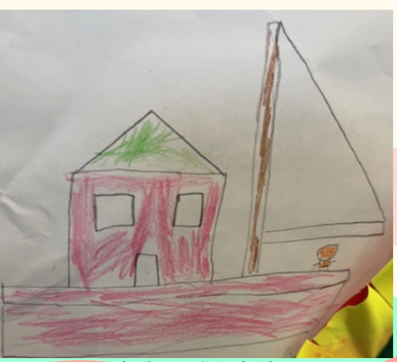
Harley's Boat, Oak Class