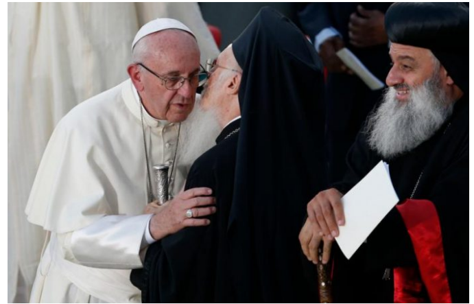
Pope Francis and Ecumenical Patriarch Bartholomew of Constantinople embrace at the conclusion of an interfaith peace gathering outside the Basilica of St. Francis in Assisi, Italy, Sept. 20, 2016.

Pope Francis, in a message to Ecumenical Patriarch Bartholomew of Constantinople, urged Catholics and Orthodox to continue the path of dialogue on key theological issues to achieve full communion between the two churches.