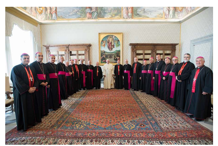
Pope Francis with members of the Synod of the Chaldean Church in Vatican City on Oct. 5, 2017.