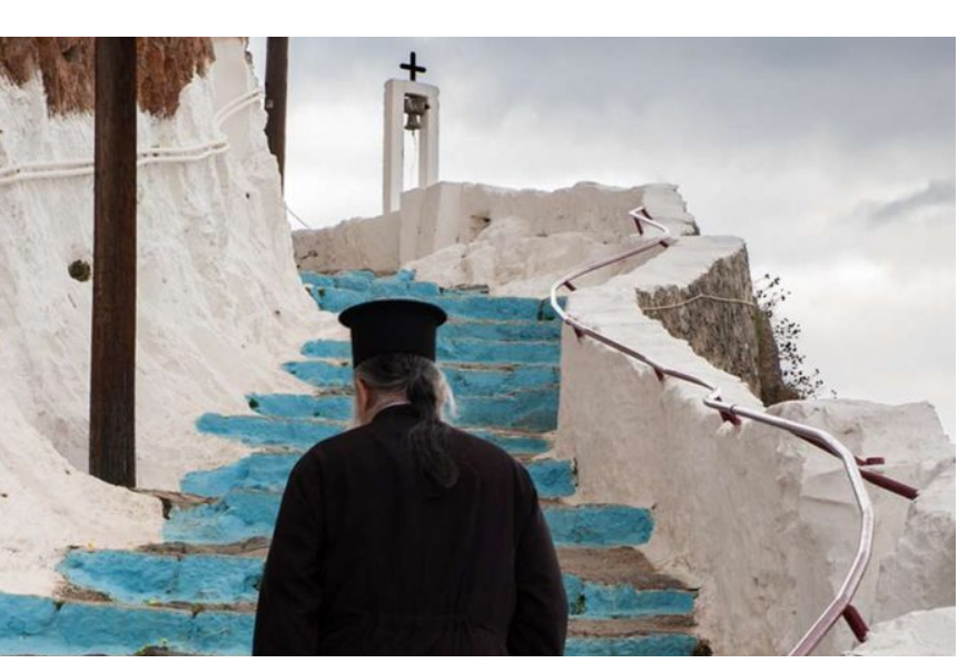
Christians have lived in the Middle East since the time of Christ.