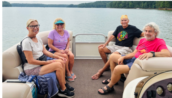
Sunset Cruise on Lake Allatoona

cooled us off a bit as we enjoyed a get together, happy hour and dinner on the water. Lake Allatoona when it is full covered more than 12,000 acres and has 270 miles of shoreline. The lake along with