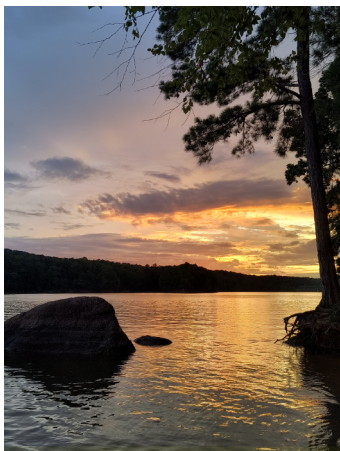
Lake View From Campsite

We braved the extensive heat while there in north Georgia limiting most of the wildlife activities and extensive hiking. We did enjoy a wonderful sunset cruise on Lake Allatoona thanks to Chuck's family, which