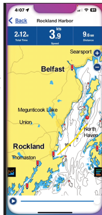
Sailing from Rockland back around Islesboro