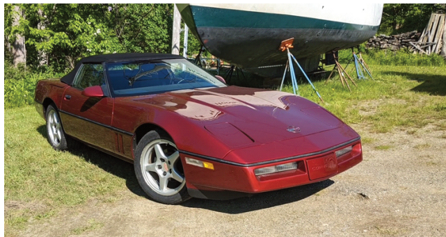
New to us 87 Corvette with Gulfstar in the background

Gulfstar Center Cockpit, we had burned up a couple days. (The fuel separator was full to the clear plastic bottom section with water. No idea how this diesel was running.) With those issues behind us, we decided to sail from Belfast down east to Rockland, ME. Nice anchorage and nice restaurants. The harbor is huge because of a giant break wall that was built in 1881. A couple of ferries go from Rockland to some of the other islands daily. We stopped in Camden Harbor along the way and saw an Oyster 745 at the dock. Just awesome. Sailing into Rockport, we saw a group of classic wooden sailboats 30 to 45 ft. on their moorings and in Rockland there were two Hinckley's at the dock, a Bermuda 40 and