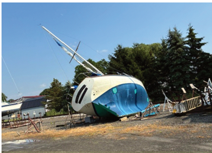
This boat had blown off its stands in Watkins Glen Storm

Lynne and I will be back in Florida on October 15 th See you for the Beach Party.