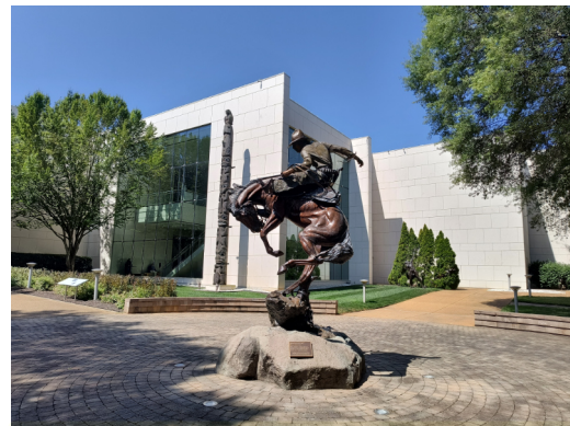
Booth Western Art Museum

One day we decided to venture out of the campground to visit a wonderful Museum in