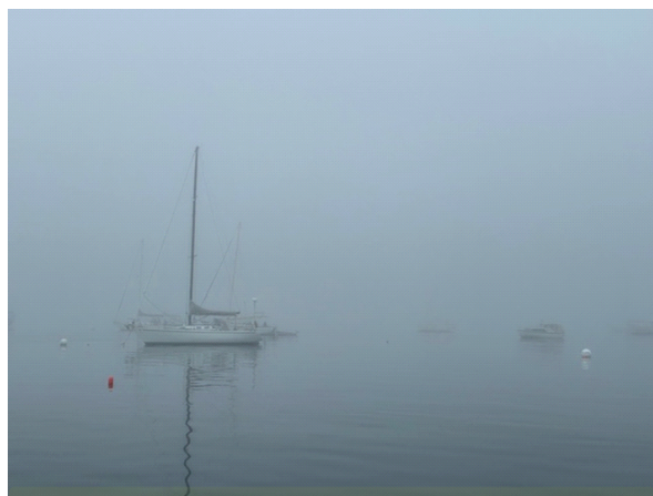
Morning Fog in Rockland Maine

about a 6 hour sail back to Belfast. But the fog stayed with us. My brother has radar and access to AIS information on his chartplotter so we could "see" other boats and hear the lobster boat engines but other than that it was just pea soup. We sailed that way at about 4 knots until noon when the fog lifted. We could hear the sea buoy bell and birds on the islands but not much else.