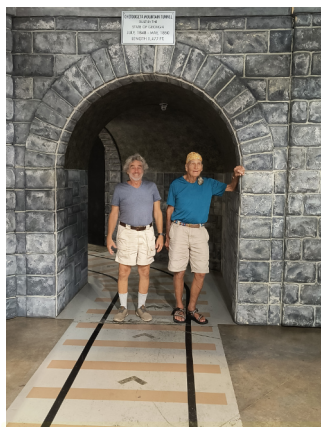
At The Train Museum

Well to my surprise, it was not only there, but a new and expansive museum was built around the historic train engine called “The General”. I had no idea what was in store for us as we purchased tickets. There was