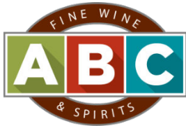
On September 28 th a few MSAers met at the ABC store in Bradenton for a wine tasting event.