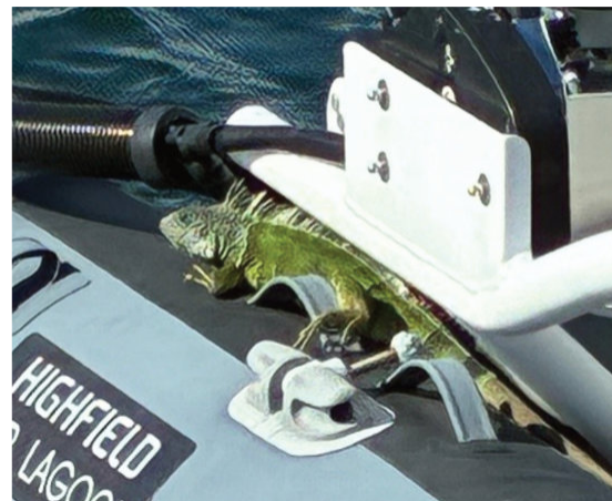
An uninvited guest on the dinghy