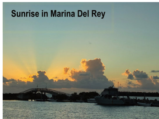
Sunrise in Marina Del Rey

One night in Honda Ensenada, we transported everyone to a restaurant "La Cocina del Navegante" (The Kitchen of the Navigator) on shore with the dinghy. We all ordered the dinner special which has a piece of grouper wrapped around a pile of scallops and shrimp. Oh my, oh my! Mojito's were the drink special and I don't recall how many of those we ordered. It