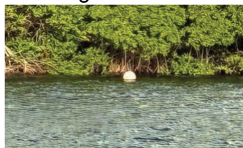
Mooring ball floating near shore. Not a good sign