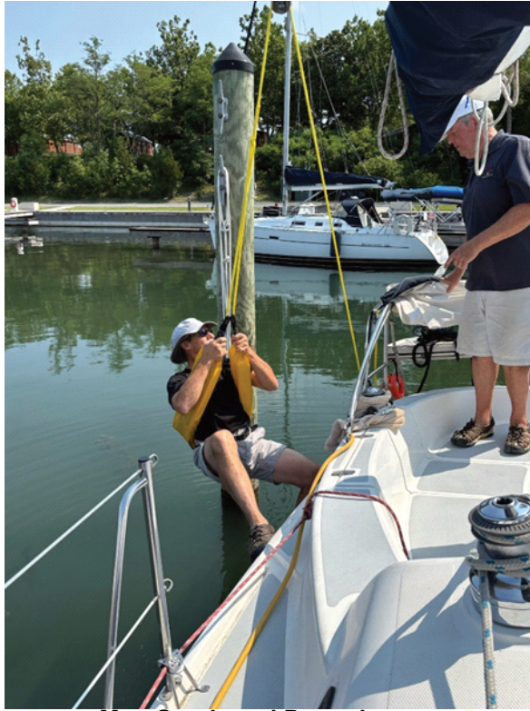
Man Overboard Procedure

our endurance, as we battled a stiff headwind all the way home.