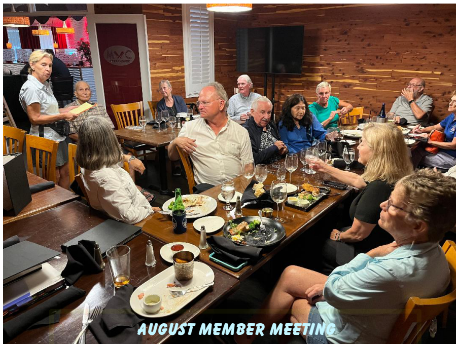
AUGUST MEMBER MEETING