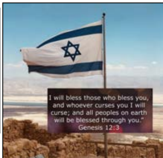
~ co-hosts ~