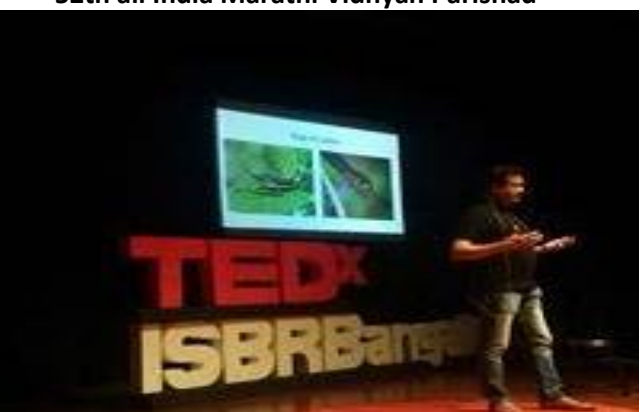
Tedx talk on Butterflies