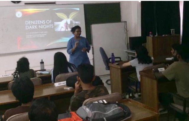
National moth week celebrated at WII