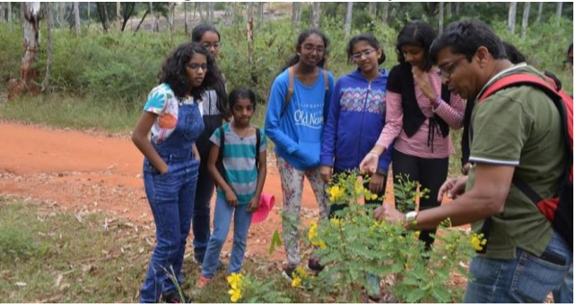
Green Birthday at Thurahalli Forest