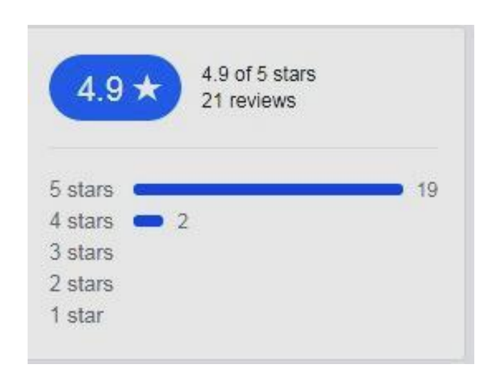
Annexure 2: Facebook Feedback