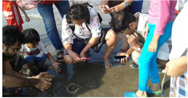
Marine Walk at Mumbai