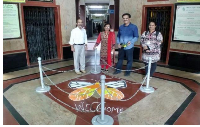
Butterfly Talk at Royal College, Mira Road