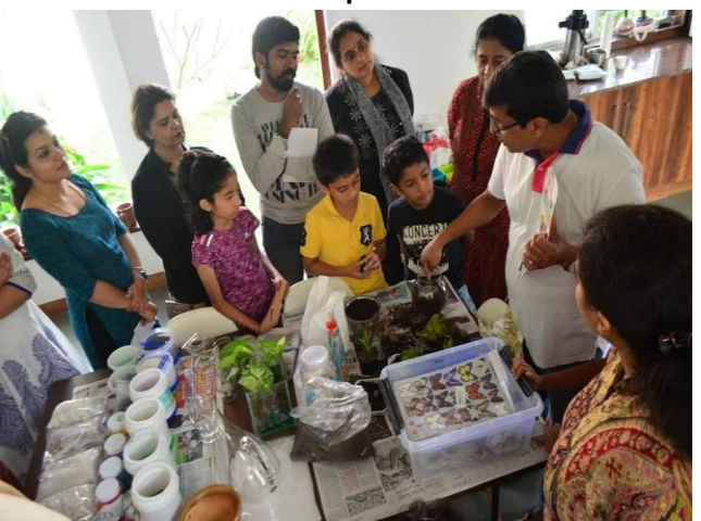
Glass Garden Workshop at Bangalore