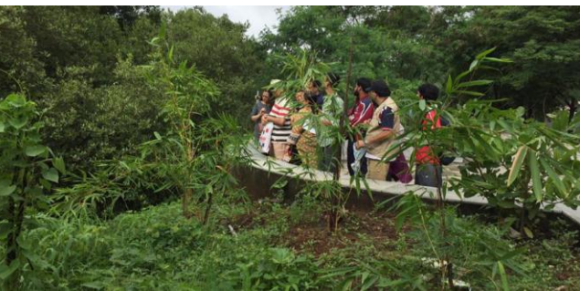
Mangrove Walk at Belapur