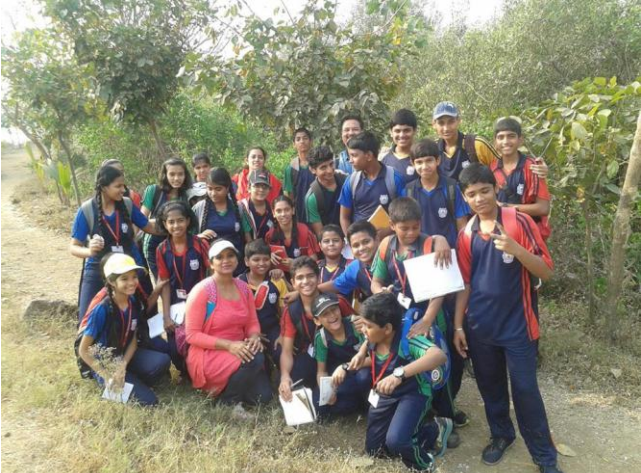
Presentation at Thane