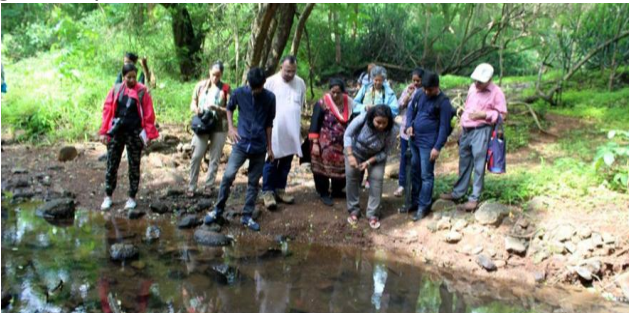
Insect Watch at Navi Mumbai

We conducted total 28 nature walks in Navi Mumbai, Mumbai and Bangalore for 849 participants. During these walk participants learned how to identify birds, trees, butterflies, insects and also got aware about the threats and conservation issues. Out of the 28 walks, 4 were conducted in Mumbai and 15 in Navi Mumbai for 637 participants, out of which 2 walks were for corporates, 3 for schools and other 14 for general public. (For table refer Annexure.4)