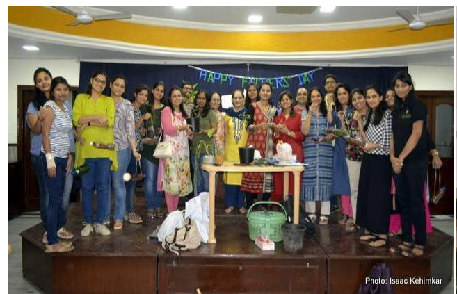
Kitchen Gardening Workshop for School

This year we conducted 12 workshops for 300 participants. Eleven workshops in Mumbai and Navi Mumbai. Two for corporate KPMG and HSBC, and one for a school, college and Wildlife Institute of India on the theme of Bees, Birds and Moths. A total 289 participants attended the workshops. Whereas, 1 glass garden workshop was conducted in Bangalore for 11 participants from general public. (For table refer Annexure.4)