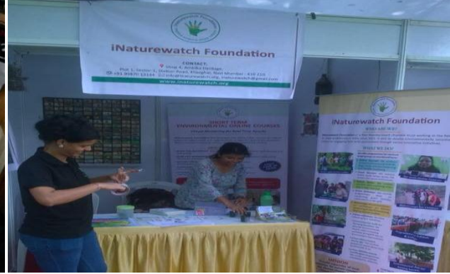
World Tourism Day Exhibition