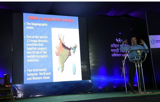
Northeast Butterfly Meet