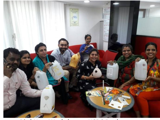
Bird Nest Workshop at HSBC Bank