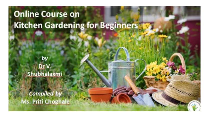
Kitchen Gardening for Beginners 2.0

iNaturewatch launched India's first crash course on Kitchen Gardening that was being offered through a virtual class. Tt was a blended course with field works and online assignments and an online course for hobby learners. It included takeaway lessons such as how to plan a kitchen garden, how to plant saplings and take care of them, what kind of tools to be used and how to recycle kitchen waste to produce a quality manure for the plants.