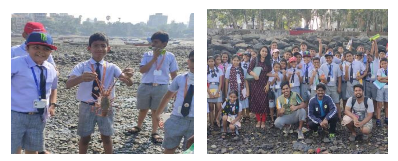
18 November : Marine Walk for M.K.E.S School students