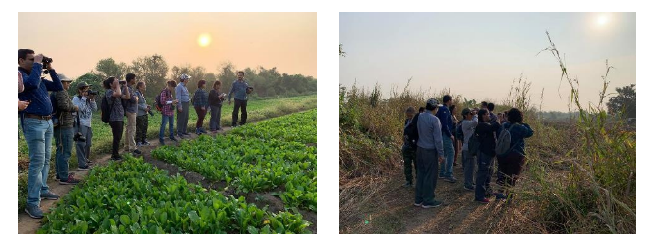
17 Nov 2019: Bird watching in Kharghar Mangroves

A group of bird enthusiasts hurdled Sunday morning at Kharghar Station to get a peek into Kharghar Mangroves. The area behind Kharghar Station is taken over farmlands. Passing through the endless patch of agriculture farms, the group witnessed several farm birds such as mynas, munias, warblers, bulbuls, egrets and doves. At the end of trail which opened to mudflats of mangroves the group saw maximum birds including mudskippers and Fidler crabs. The sighting included Godavit, Plovers, Curlew, Ibis, Purple and grey heron, cormorants, painted stork, Common and White breasted kingfishers and so on. The entire pathway was dotted a riots of wildflowers mostly glories from Ipomoea group. The group did draw a good amount of attention by the station goers wondering what we are upto..