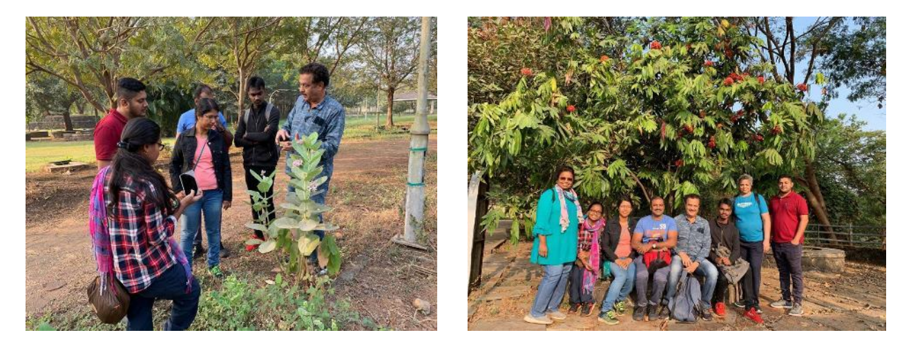
4 Jan 2020: Tree Walk at Central Park, Kharghar

Built on lines of Central Park of NYC, Central Park in Kharghar is the largest urban park in Asia with 290 acres and third largest in the world. on plantation we could assign a particular pathway to a tree e.g. Sita Ashok Lane, Peepal Lane, Tabebua Lane, Copper pod Lane, Laburnum Lane and Wild Almond Lane. The other trees who were the remanent of original forests included; Red Silk Cotton, Mahuva, Soccer Ball, Asan, Palymra, Charcoal tree, Banyan, iron tree and so on. The other highlights included hibernating stink bugs, harvester ants busy dehusking. Caterpillar of plain tiger and humming bird hawkmoth and green lacewing. There were good number of birds too such a Yellow wagtails, Black Drongo, Red Wattled lapwing, Shikha etc ,