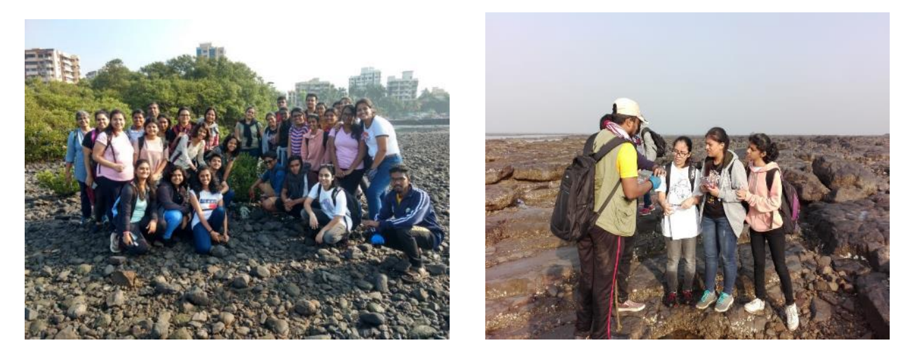
14 Jan 2020: Free Marine Walk at Chimbai Beach for Xaviers College students

sp., Ceratium sp., Amphipods, Sponges and sea anemone. Ghost fishing was found and live berried crabs found in the netting. There was an unplanned mangrove cleanup taken up by the students which indicated awareness in the current generation.