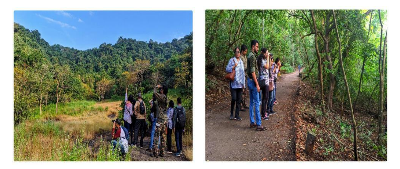
3 Nov 2019: Bird watching at Green Valley Park, Belapur