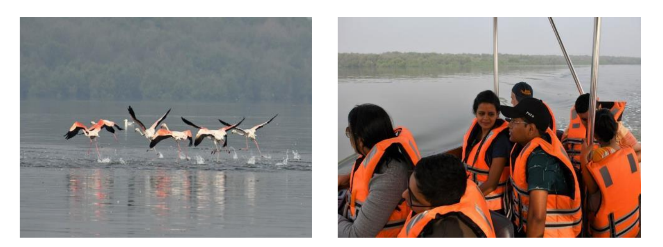
24 Dec 2019: Flamingo Boat Ride at Airoli