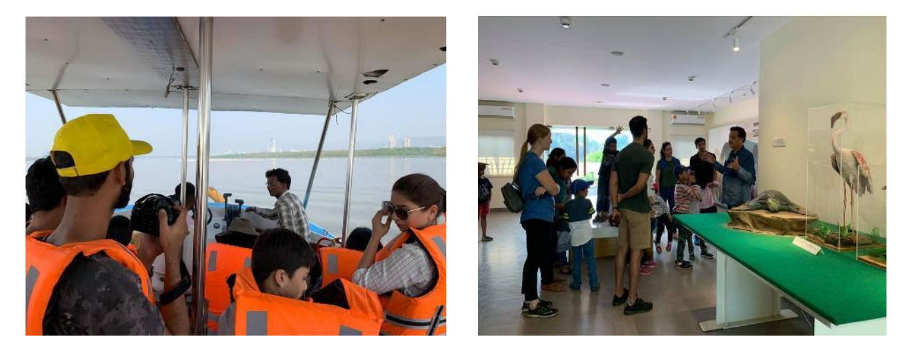
15 Dec 2019: Flamingo Boat Safari

We conducted first Flamingo Boat Safari for the season. We were joined by a group of 24 birding enthusiasts families. We began our afternoon programme with a tour to the Marine Centre followed by a brief walk among the mangroves. The participants patiently waited for the boat ride. As the journey began everybody were elated to see the lush green mangroves and basically enjoying the sea ride. Their excitement heightened when they got to see a large flock of Pied Avocet following by a large flock of flamingos. They were speechless to watch them inflight. Everybody expressed their gratitude for exposing them to mystical world of birds.