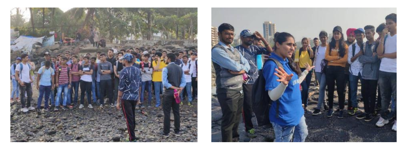
17 Dec 2019: Free Marine Walk at Chimbai Beach for Khalsa College