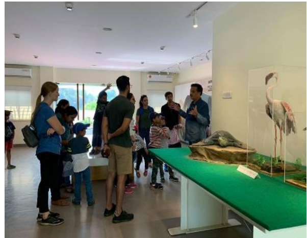
15 Dec 2019: Flamingo Boat Safari