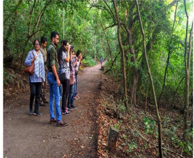
3 Nov 2019: Bird watching at Green Valley Park, Belapur