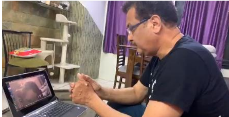
19 Jan 2020: Free Webinar on Tree Plantation Tips

plantation and seed bombs. The science behind tree plantation was explained and the do's and dont's were discussed.