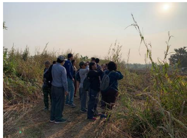
17 Nov 2019: Bird watching in Kharghar Mangroves