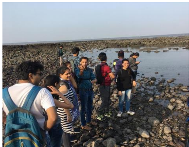
15th Jan 2010: Marine Walk at Chimbai Beach for Somaiya College Students