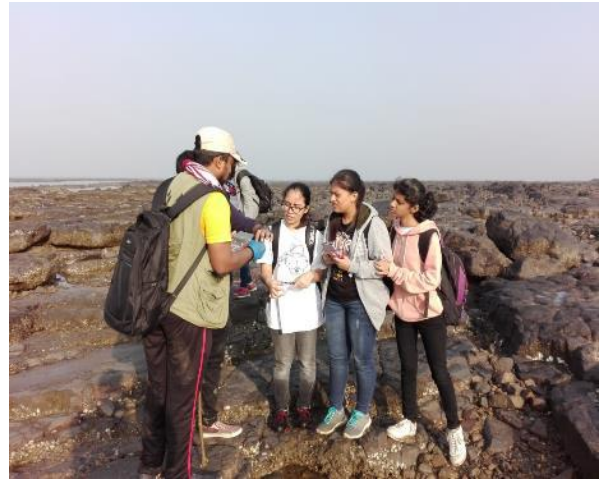
14 Jan 2020: Free Marine Walk at Chimbai Beach for Xaviers College students