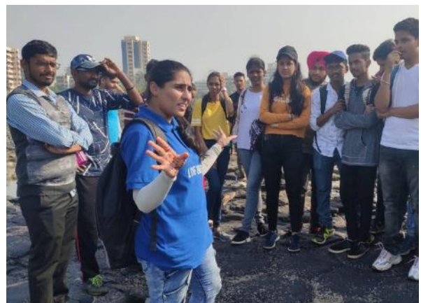
17 Dec 2019: Free Marine Walk at Chimbai Beach for Khalsa College