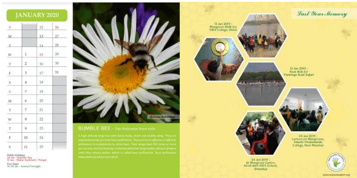
Insect Eco Calendar 2020

We are happy to present our desk calendar which is based on the theme of insects. It has 12 different striking images of various insects each for a month marked with eco-days of that month. You could learn about our activities of last year