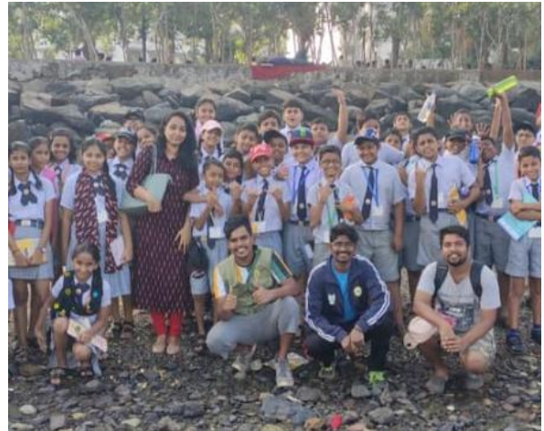
18 November : Marine Walk for M.K.E.S School students