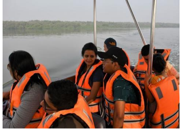
24 Dec 2019: Flamingo Boat Ride at Airoli