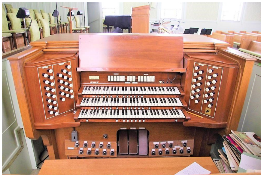
19 Ranks - 1,250 Pipes

First Baptist Church, Waynesville · Reuter Organ Company Opus 1025