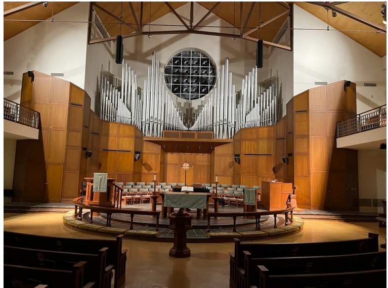
First United Methodist Church, Waynesville NC Casavant Frères Opus 3774, 1998 · 50 ranks, 3 manuals