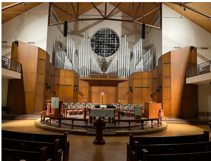
First United Methodist Church, Waynesville NC Casavant Frères Opus 3774, 1998 · 50 ranks, 3 manuals