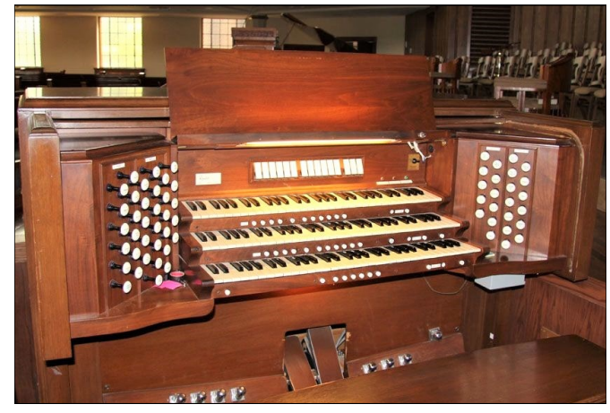
Reuter Opus 1571, First Baptist Asheville

Service of Lessons and Carols , December 4, 7:30 pm Scott Concert Hall, Porter Center, Brevard College