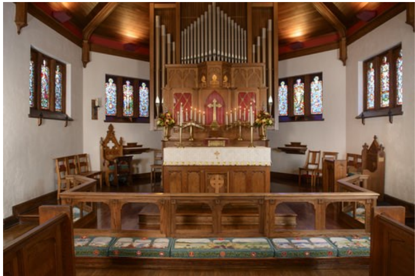
Calvary Episcopal Church, Fletcher NC Holtkamp Organ Company (Opus 2034, 1992)