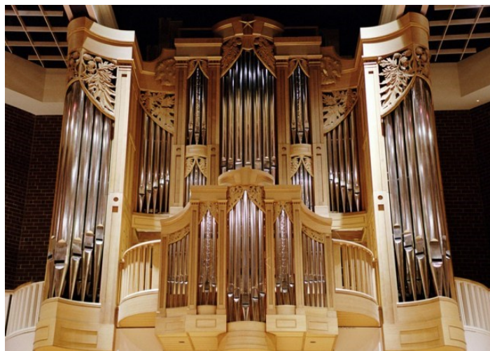
Jaeckel Opus 43 (III/69), Brevard College