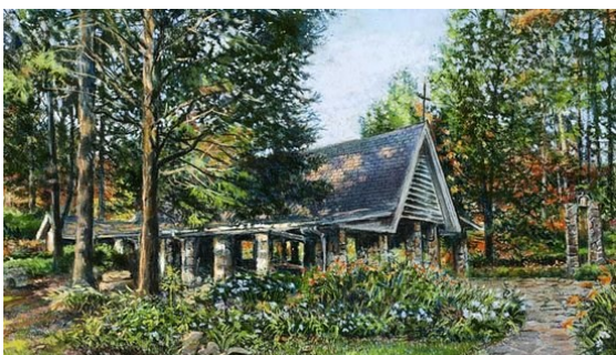
Faith Memorial Chapel, Cedar Mountain