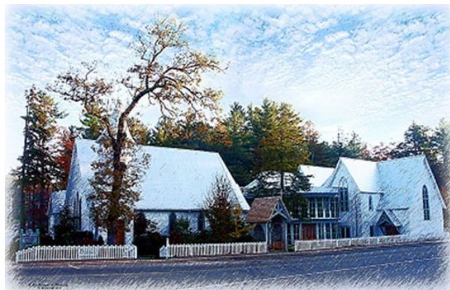
Church of the Incarnation, Highlands

Church of the Incarnation (Episcopal) in Highlands, NC seeks an experienced baritone/bass-baritone staff singer for the 10:30 am service. One trip, Sunday only position with occasional extra services for extra pay. The Incarnation Choir is a friendly, welcoming group of 8 professional and 8 volunteer voices. Please contact for more information.