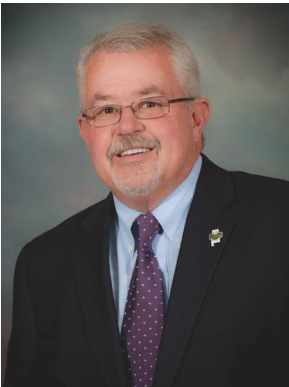
CITY OF GARDENDALE | MAYOR STAN HOGELAND

DEMOGRAPHICS: 2010 Census: 8380 | Total Area: 12.20 square miles (31.59 km 2 )