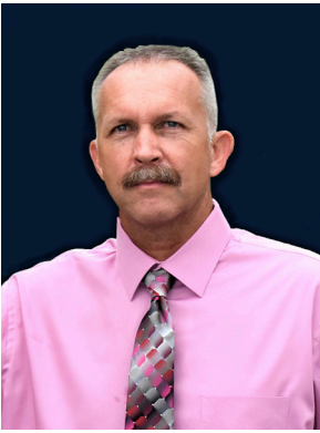
CITY OF FULTONDALE | MAYOR LARRY D. HOLCOMB Mayor Holcomb

CITY HALL: 1210 Walker Chapel Road | P.O. Box 699 | Fultondale, AL 35068